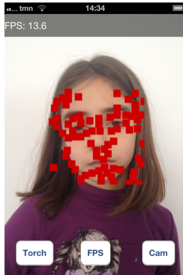
Fig. 2 – Interest points in child's face.

of space and daily routine as well as the type of interactions established. Enabling environment created by the intentional act of kindergarten teachers constitute itself as a key element in the involvement of children. If the observation data indicate that children are not involved, adults should reflect critically about the aspects to improve (Fig. 3).