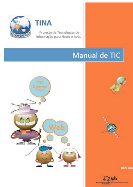
Figure 1. Handbook of ICT

The organization and training of this project was responsibility of the authors of this paper, with the support of the institution (ESE-IPB) and the partners involved (Mogadouro City Hall and Social and Holy Centre Santos Mártires of Bragança). Between January and March 2010 were made every reasonable effort to project implementation on the ground. The disclosure was made through posters, leaflets, news in local newspapers, the website of the institution (ESE-IPB), the project page on Facebook ( http://www.facebook.com/pages/Braganca-Portugal/Projecto-TINA/115448758465209 ) and partners. It was also made a handbook of ICT in order to help grandparents and grandchildren on this trip by ICT/Internet, accompanied by the grandfather “Continhos” and his grandchildren: “Bilhó” and “Casquinha” (Fig. 1).