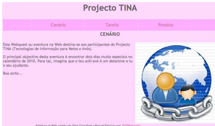
Figure 2. TINA Project Webquest

Then came the contest based on Webquests of the TINA Project Webquest (Fig. 2) whose task was to find two special dates in the year 2010.