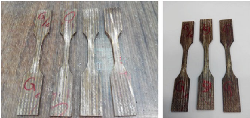
Fig. 2 Composite specimens for tensile tests

the residual NaOH. These fibres were then dried in an oven at 45 °C during 12 h. The second step was the silane treatment. For this treatment, a solution of 5% 3-aminopropyltriethoxysilane by weight (weight of silane relative to the weight of hemp or flax mat) diluted in a 50% aqueous solution of methanol was used. The pH of the solution was kept between 4 and 5 using acetic acid. The mats were submerged in the solution for 4 h at 28 °C. After that period, they were washed with distilled water and finally dried in an oven at 45 °C for a period of 12 h.