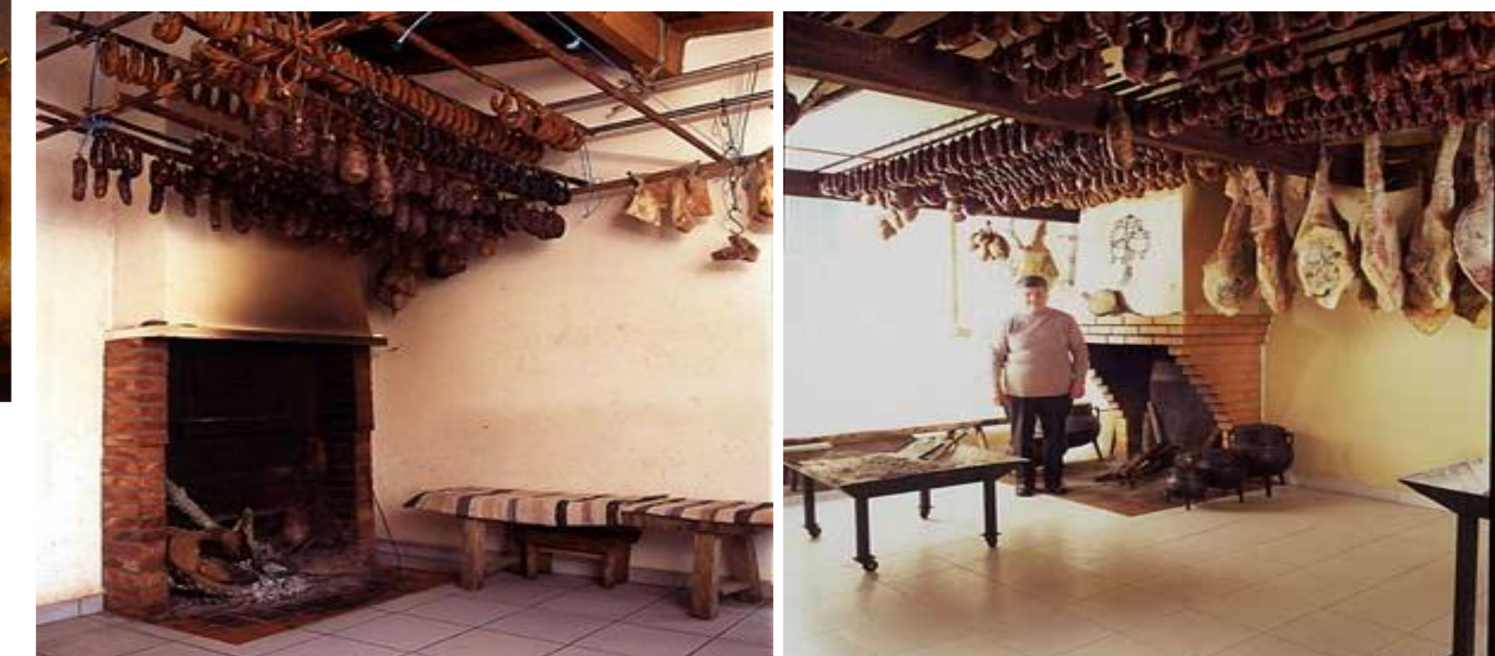
Figure 2 – Regional kitchens.