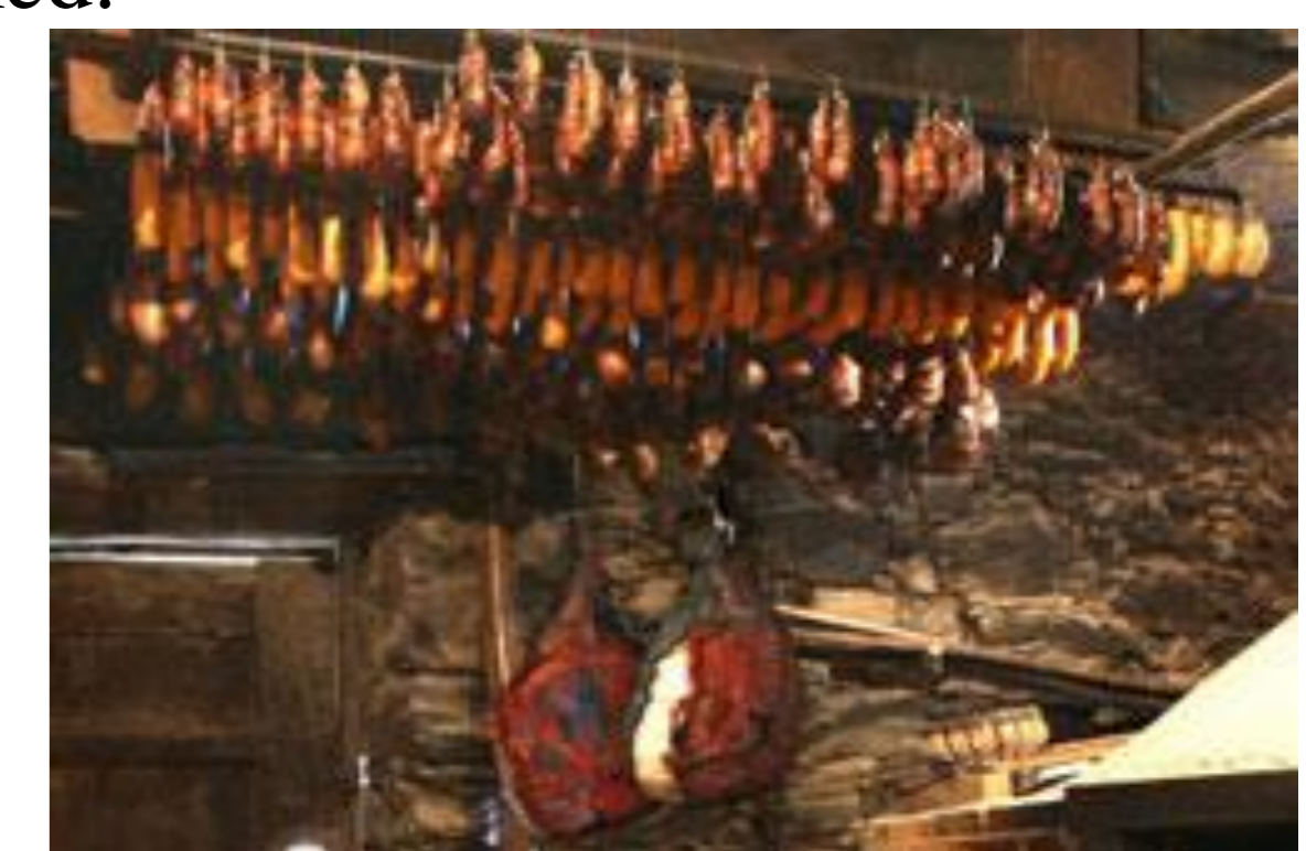
Figure 4 – Smoking phase.