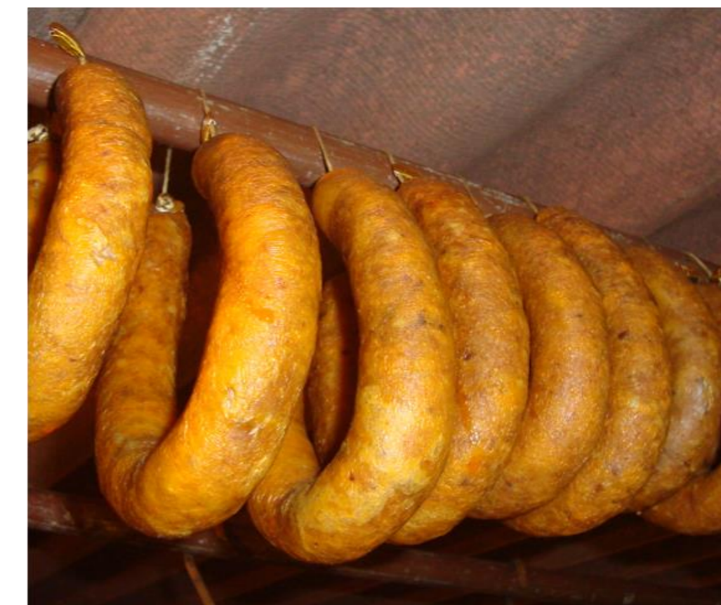
Figure 1 – Alheiras .