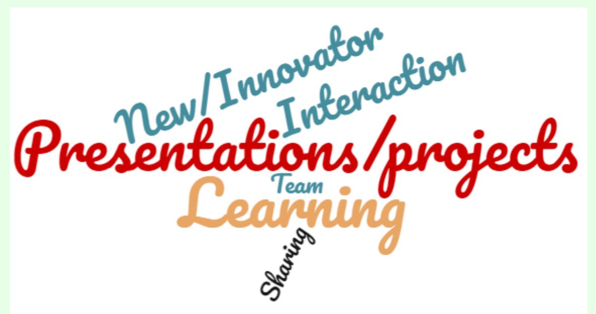
Figure 2: Qualitative analysis of the last event about students' perception experiences.

This kind of categorical tree reveals the meanings and the significances that the interaction and the group assumes in life students.