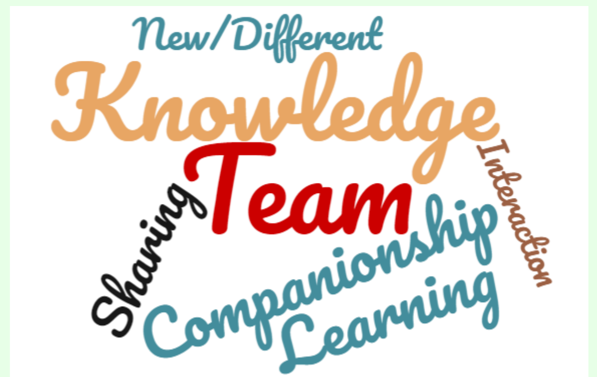
Figure 1: Qualitative analysis of the first event about students' perception experiences.

In last moment, the categorical tree reveals 3 main categories (and its components):