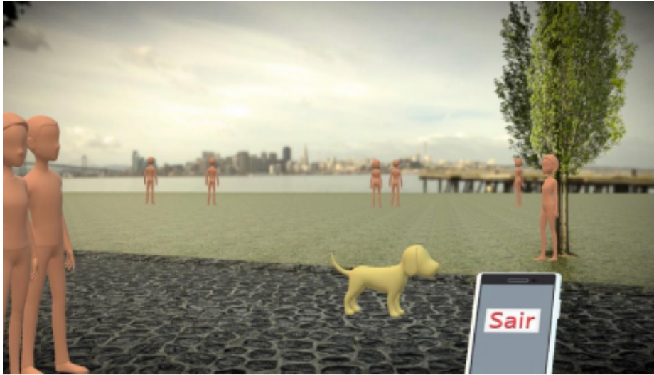
Fig. 7. Scenery to leave the environment