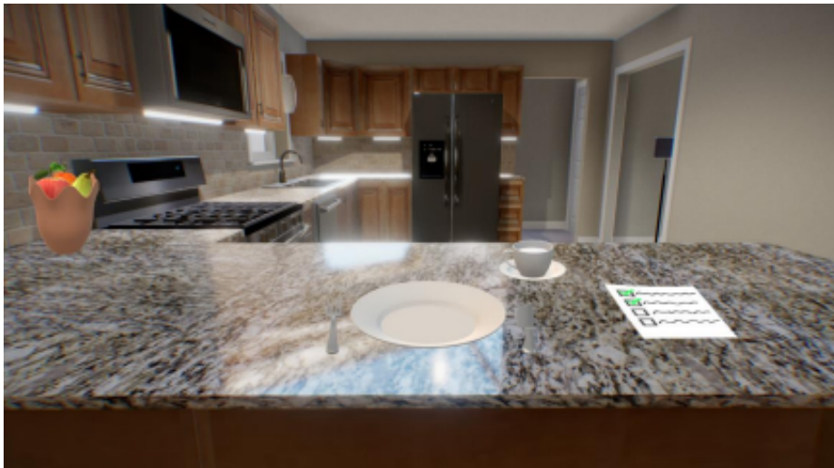
Fig. 5. Postit with the options in the kitchen scenario

with a cloth. To finish the simulation, the patient only has to leave the kitchen through the front door.