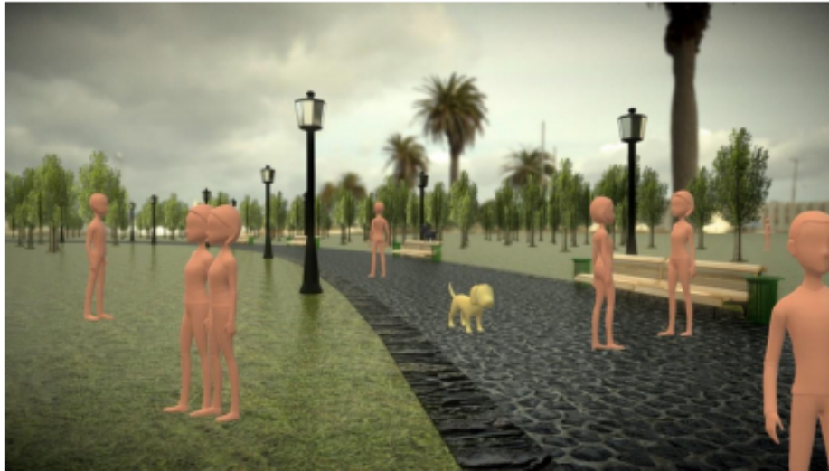
Fig. 6. Park scenery

the remote control that virtual reality has created to move by teleportation in this virtual world. In the virtual environment created, the user will be in a park surrounded by many people, as we can see in figure 6, in which he will be able to interact with some objects, such as benches and/or drinking fountains, as well as with some animals that will be present there, such as dogs or cats and some avatars.