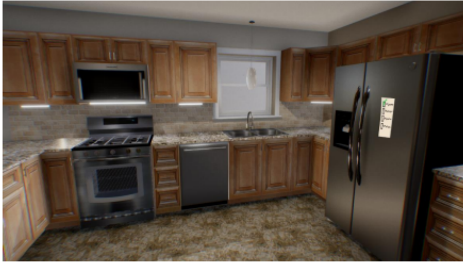
Fig. 4. kitchen scenery