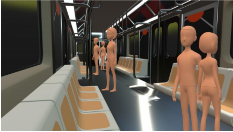
Fig. 3. Metro interior scenery

a few seconds and not start again, giving the patient time to get off the metro. The simulation ends the moment the patient leaves the metro and goes to the exit of the station, whether they exit via the emergency button or normally, like any other passenger.