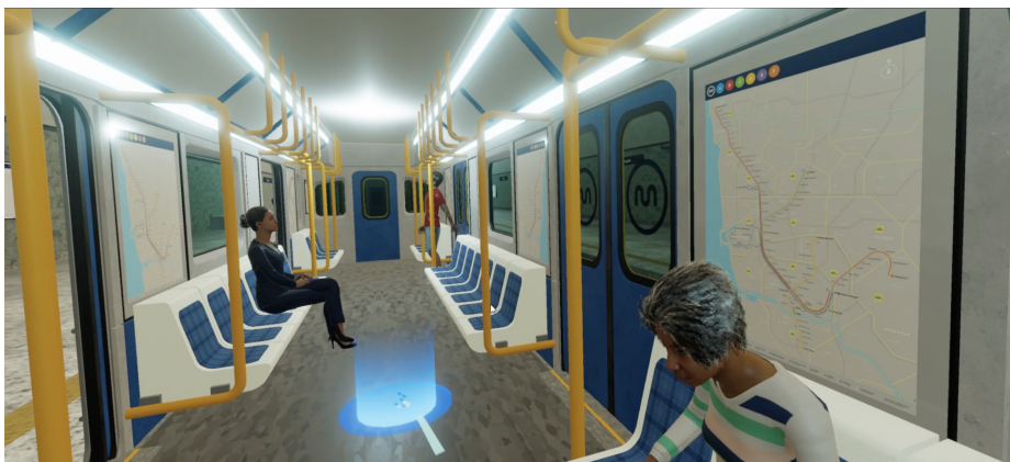
Fig. 9. Developing Scenery