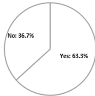
Fig 2. Difficulty in carrying out silvopastoral activities

In general, the majority of interviewees stated that they felt difficulties in implementing silvopastoralism (63.3%), as shown in Figure 2.