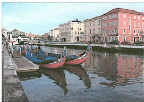
XVI Encontro Luso-Galego de Química