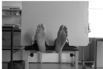
FIGURE 1. Isolation of the feet temperature.

The images were collected by a thermal camera (FLIR 365) positioned at a fixed distance of one meter of the patient's feet.