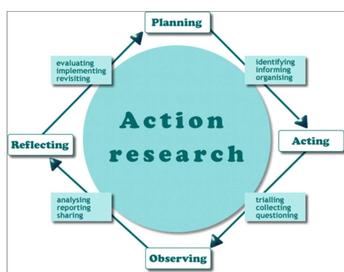
Figure 1. Action Research stages (techknowtools.com, 2014)

The team adopted two methodologies: action research and participation. As far as action research is concerned, we drew from the previous project the assumption that implementing and testing an initial theoretical approach should be followed by an effective action in the community and then by observation, which enables the team to reflect upon the pros and cons of such an action and consider changing it in some degree, before moving on. (Cf. Lewin, 1997; Bradbury, 2015; Tanabe, Pearce & Krause, 2018; Searle et al., 2021)