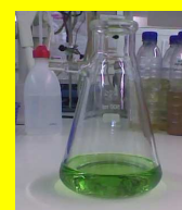
Fig 1- Ethanolic extract of Thymus citriodorus

The phenolic compounds of Thymus citriodorus were obtained by extraction with aqueous ethanol (80%). The total phenolic compounds of the ethanolic extract (Fig 1) were determined by an adaptation of the Folin-Ciocalteu procedure [2] and the flavones/ flavonols content was accessed following the procedure of Popova et al [3]. The phenolic characterization was performed by fractionation of the extract by reversed-phase HPLC and further analysis of the major phenolic compounds by ESI-MS and MS n . The HPLC analysis was performed on a RP-C18 column 250 mm× 4 mm id, 5µm bead diameter (Temperature of 30°C, flow rate of 1 mL/min). The mobile phase comprised (A) 0,1% formic acid in water and (B) 0,1% formic acid in acetonitrile and the solvent gradient started with 90% A and 10% B, reaching 40% B at 30 min, 5% B at 40 min, then returning to the initial conditions at 50 min. The antioxidant activity was accessed by measuring the 2,2-diphenyl-1-picrylhydrazyl radical (DPPH) scavenging potential [4] and its reducing power[5].