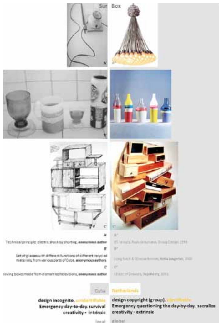
fig. 1 - Analogisms between design in Cuba, regarding the research done by Pénélope Bozzi and Ernesto Oroza, 2002 and the Droog Design approach.