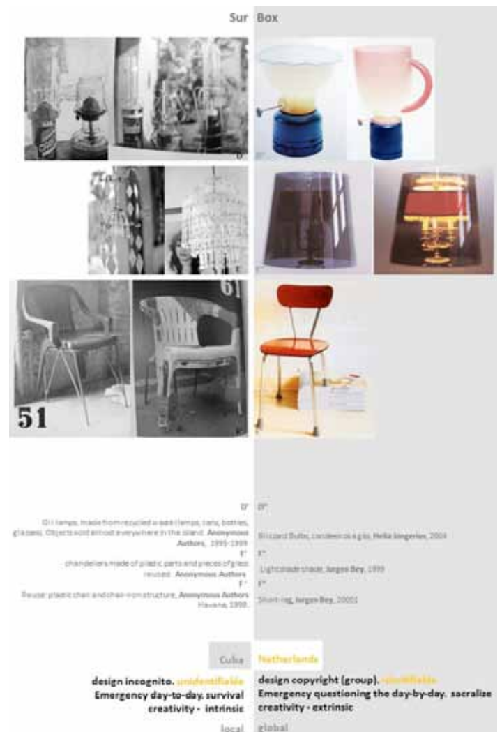
fig. 2 - Analogisms between design in Cuba, regarding the research done by Pénélope Bozzi and Ernesto Oroza, 2002 and the Droog Design approach.

The medium here established permit also other questions about influence and affluence or between the creativity in two distant poles regardless the symptoms of identity and nonidentity. In comparison on possible ways or fields as their diversity in geographic, socially and culturally, develop cognitive and perceptive inflows to challenge the