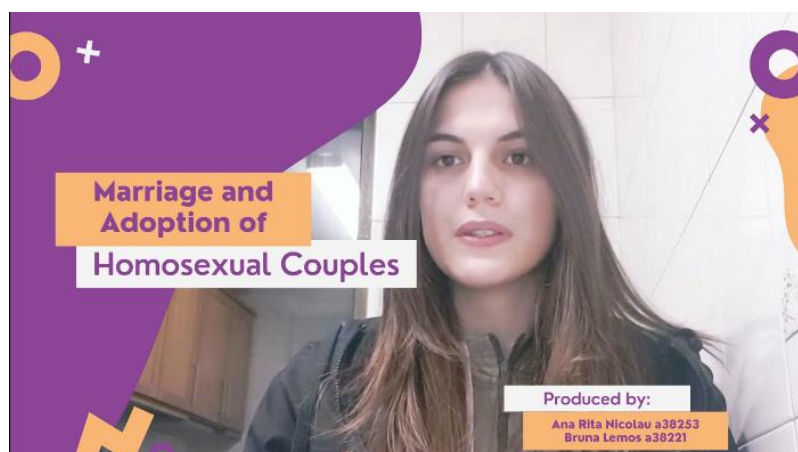
Fig. 3. Multimodal essay 1

Below we present 3 examples of multimodal essays: Fig. 3 represents the essay by two students who not only worked on the soundtrack and included text, images and colour, but also acted out their discussion as if they were housemates conversing on the topic of marriage and adoption by homosexual couples; Fig. 4 is taken from a one-man essay, where the student acted out several characters that approached the topic of human rights applied to Mozambique while under the Portuguese rule; at last, Fig. 5 presents a less creative and multimodal essay that was clearly the result of transferring a written text to the recording of what was then turned into a video.