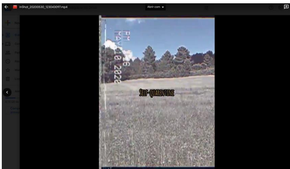
Fig. 1. Example of a coronavirus journal in video format

studying COVID-19, interesting times for “doctors and historians”. As a project work to be developed throughout the semester, the purpose of this activity was to challenge students to keep their own coronavirus journal or vlog. Students should record or write a few paragraphs every week or every two weeks, reporting on their week, e.g., how school was going (if some uneventful thing came out related to COVID-19), what the media reported, any science advancements regarding a vaccine (still under development then). They could also simply put forth their feelings about the pandemic and the impact it had on the world, more generally, and on their country and community, more specifically. While they were reporting on a real and life-changing event, they were also being critical about the world around them. Some students maximised their creativity, as figure 1 illustrates. This student recorded her own coronavirus journal and she excelled in her work. Titled “Self-quarantine”, this video shows the student’s creativity and critical thinking as she was reflecting on the pandemic and its consequences and the impact it had on her life. She also made good use of technological devices that allowed her to record and edit the video. Some students kept a written coronavirus journal, as figure 2 illustrates.