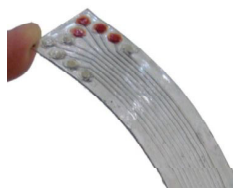
Fig. 1. Potentiometric multi-sensor system built using print-screen technique with 20 polymeric membranes (in duplicate).

The electrochemical multi-sensor device used (an electronic tongue, Fig. 1) includes two print-screen devices, each composed by an array with the same 20 potentiometric sensors, based on all-solid-state potentiometric electrodes with polymeric membranes. These chemical sensors have high stability and cross sensitivity to different species in solution (non-specific and with low-selectivity polymeric lipidic membranes) and are suitable for analyzing complex liquid samples as previously reported [5]. Each sensor was identified by a code using the letter S (for sensor), followed by the number of the array (1 or 2), followed by the number of the polymeric membrane (1–20, where each number represents a different mixture of plasticizer and additive used). The potentiometric signal from each sensor (varying from -1.0 to +1.0 V) was measured against an Ag/AgCl reference electrode and recorded using a multiplexer equipment from Agilent.