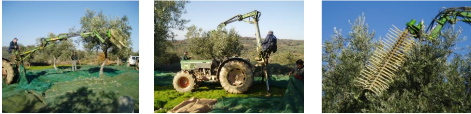
Figure 1: “Oli-Picker harvester at work.