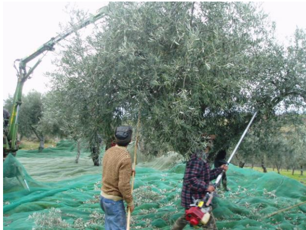
Figure 3: Second year observations - Oli-Picker harvester and a mechanical branch shaker operated by a labourer, working simultaneously.

So, it was not necessary to use another Oli-Picker station to complete the fruit detachment of each tree (Figure 4), like in the first year observations.