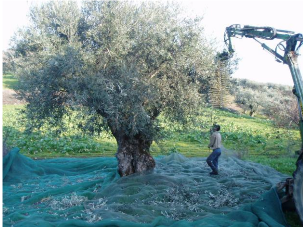
Figure 5: In a big olive tree the rotor detach the fruits more efficiently than the trunk shaker.