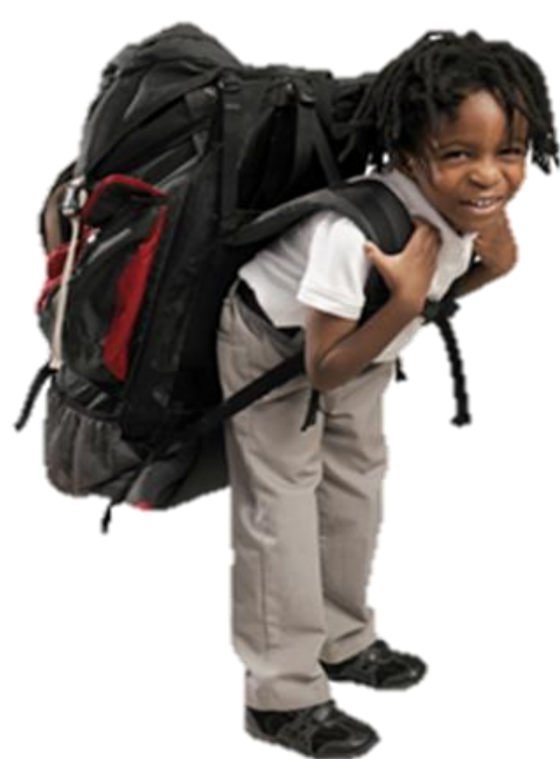
Figure 1. Single backpack overload.

Gregorczyk concluded that the use of this type of device, increases the metabolic cost, not being metabolically sustainable for more than brief periods even in physically fit young people, thus opening an important window relevant for study with "double backpack".