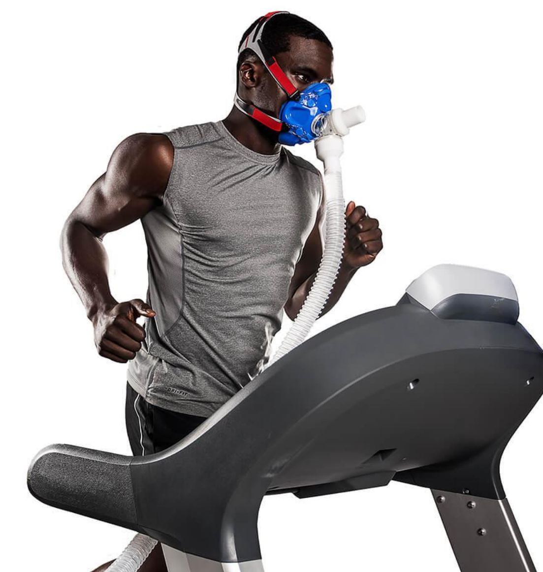
Figure 5. Example of measuring oxygen consumption (VO 2 )

To mislead reading errors or health problems, an initial screening will be performed so that we can select only individuals with low or normal body fat (important to the measurement of the thermography technique) and no relevant health history that may adulterate the intended measurement values, like asthma, other kind of allergies or any other kind of limiting movement . Thus it will be accept only healthy young adults to perform the tests on this gait study.