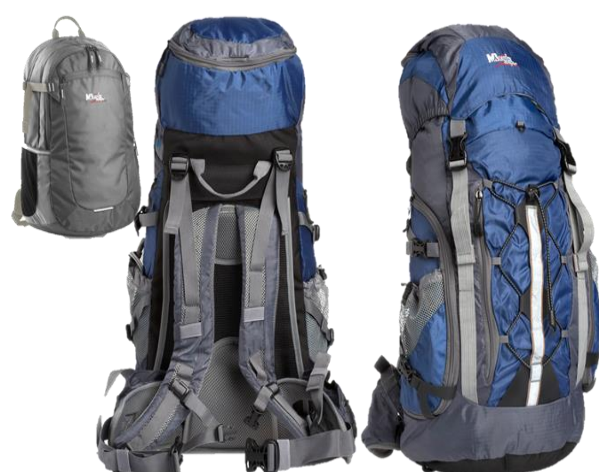
Figure 2. Double Backpack Front and rear.