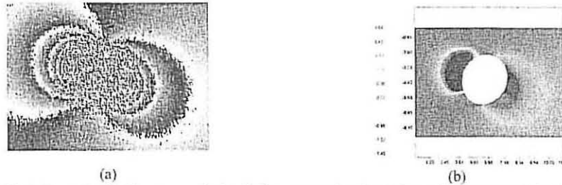
Fig.1 Example of a Phase map obtained after stress relaxation (a) and displacement field of stress relaxation after image processing (b).

phase maps are similar to the one presented in Figure 1(a). In Figure 1(b) it is possible to see the displacement field after image processing. In this case the stress values were codified in a false colour table.