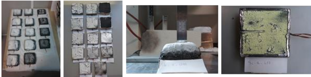
Figure 1: Coated steel plates before and after accelerated aging, with fixed thermocouples. Tested samples at 35 and at 75 KW.m -2 .

The temperature variation of different samples before and after aging test for a radiant heat flux of 75 [KW/m 2 ] and thickness of steel plates ds=14 [mm] are shown in Figure 2 and Figure 3, respectively.