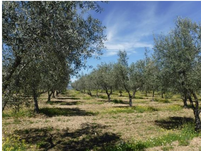
Figure 1. Olive orchard example used in field trials

Field tests took place in Portugal - Trás-os-Montes region from 2018 to 2020 in irrigated olive orchards with the cultivars “Cobraçosa” and “Verdeal Transmontana”, with 200 trees per hectare, spaced 7 m x 7 m (Figure 1).