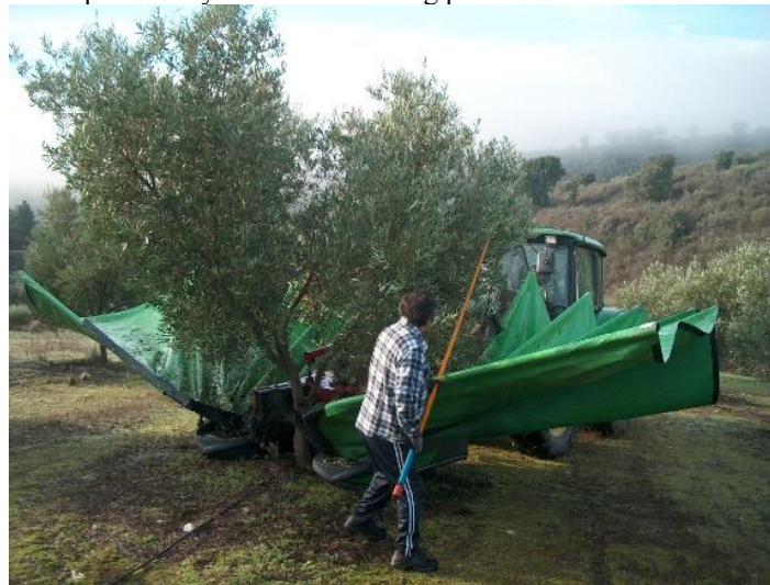
Figure 2. Complementary manual harvesting procedure

Figure 2 shows the complementary manual harvesting procedure.