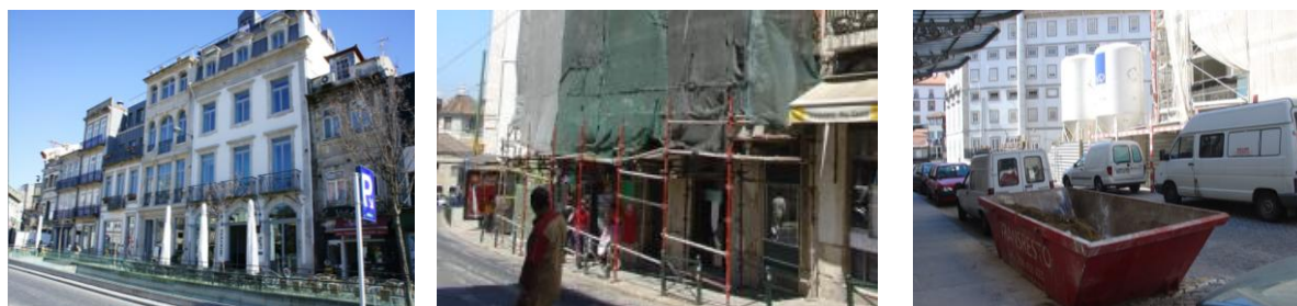
Figure 2. Some “Surrounding and location” aspects to attend in the project designs

Green and leisure spaces”. However, a set of interviews which complemented the documental review revealed that all the fifteen interviewees saw pertinence and interest in the inclusion of these parameters in the design stage (see Figure 2). One of the interview questions addressed the referred parameters as constraints and the pertinence of considering them during the construction phase, which was confirmed with interest by all the interviewees [2].