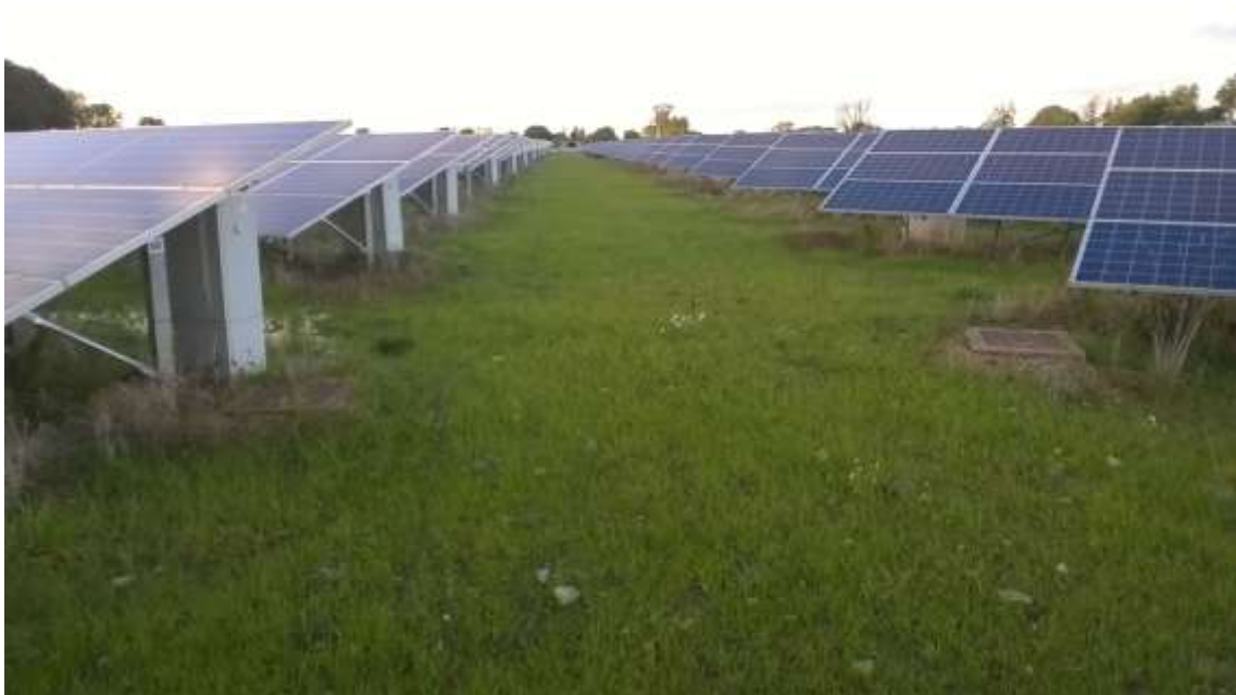
Figure 8 – Established grassland (Six Hills – Martifer Solar)

One of the measures that will use to maintain the productivity of grassland without the need of machines, is a seed mixture of 100% perennial ryegrass with a variety of species such as: timothy (highly palate), meadow fescue (tolerates wetter conditions), cocksfoot (deep rooting and suitable for dry soils), and alsike cover (tolerates lower pH and soil fertility) (HCCMPW, 2016) (see figure 8).