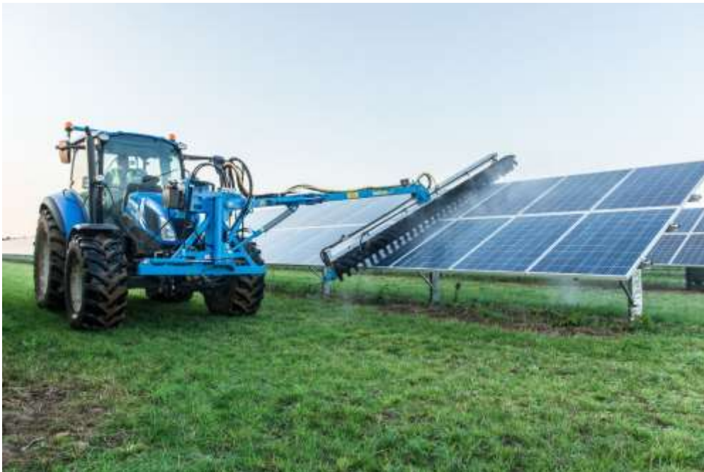
Figure 5– Module cleaning by automated machinery

Another method of module cleaning is by using automated machinery (figure 5). This system uses pressurised sprays of water and a rotating brush head to wash solar panels. When compared with the manual methods this method uses less water and can be adapted for use on a wide variety of machines and also locations (Lightsource, 2016).