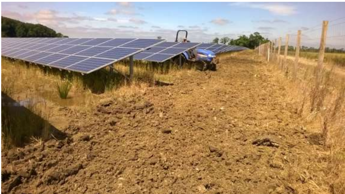
Figure 7 – Preparation of the soil to receive the seeds. (Six Hills – Martifer Solar)

Before planting the lettuce seeds, the soil should be loose (figure 7) , well drained and fertile (Marrou, H.; Dufour, J.; Wery, J., 2013).As the land use before construction was wheat that was grown constantly (monoculture), this would likely have required fertiliser before lettuce planting would take place.