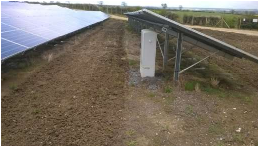
Figure 6 – Junction or string combiner box. Six Hills Solar Farm

The junction or string combiner box (figure 6) should be checked periodically for water ingress, dirt or dust accumulation and integrity of the connections within the boxes, to prevent corrosion or short circuit events that could affect the overall performance of the PV plant (Miller, A.; Lumby, B., 2015).