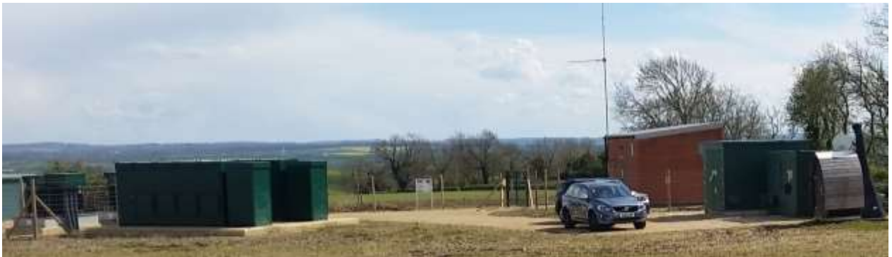
Figure 4 – Inverters, transformer, switchgears, client substation, DNO. Six Hills Solar Farm (Martifer Solar UK)

The electricity generated by the PV panels will be in the form of direct current (DC), so the inverters (centralized inverters are each co-located with transformers, which will be positioned strategically throughout the site) will convert this variable DC into alternating current (AC) suitable for supplying the electrical grid. This electricity generated AC will be forwarded by transformers to the client substation (Figure 4.), then the generated power will be exported to the DNO distribution (Stud Farm , 2015)