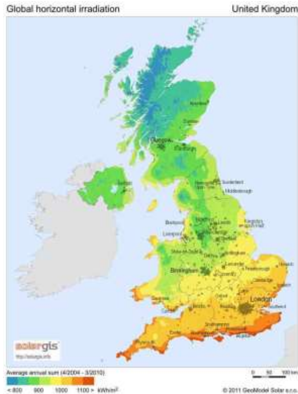
Figure 1– Global Horizontal Irradiation in UK (European Union Maps, 2011)

The current solar energy resource in the UK offers a huge untapped potential, especially in the South of England and Wales (see figure 1). Where the amount of electricity that can be generated by an optimally positioned 1 kilowatt (kW) rated PV solar panel (i.e. in a yellow area Leeds, a 1kW solar panel should produce 825 kW hour (units) of electricity in a typical year while in a brick red area Plymouth would produce around 950 kW hour) (European Union Maps, 2011).