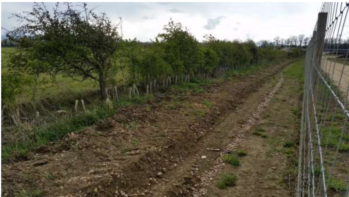
Figure 9– Hedgerows (Six Hills- Martifer Solar UK)

The hedgerows should have a variety of shapes, sizes and woody species, which will provide species with flowers and berries at different times, therefore providing food over a longer period. Oaks can be a good option, because they support a wide variety of insects. Old trees often have holes in which blue tits, owls, kestrels and bats can nest (RSPB, 2016).