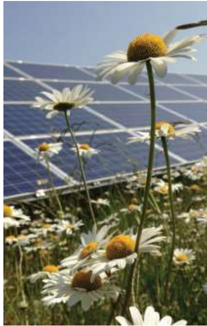
Figure 10 – Wildflower meadow (Parker, 2014).