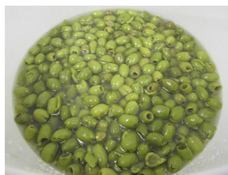
Figure 1: Stoned table olives, "Alcaparras"

Bread is fundamental for the diet of worldwide, being its main ingredients flour, water, yeast and salt (GOESAERT et al., 2005). Globally there are several types of bread, to which several ingredients can be added. Stoned table olives, called "alcaparras" (Figure 1), are one of those possibilities. "Alcaparras" are processed from healthy olives that are broken to separate the kernel of the flesh. The pulp is placed into water to remove its bitterness. Subsequently, they are stored in salt water. (SOUZA et al., 2008). These stoned table olives are a typical product of Trás-os-Montes region. Thus, the main objective of this study was to develop and characterize in chemical terms wheat bread with stoned table olives, following the traditional recipe of the Transmontano bread, associating this way two excellent products of Trás-os-Montes region, northeast of Portugal.