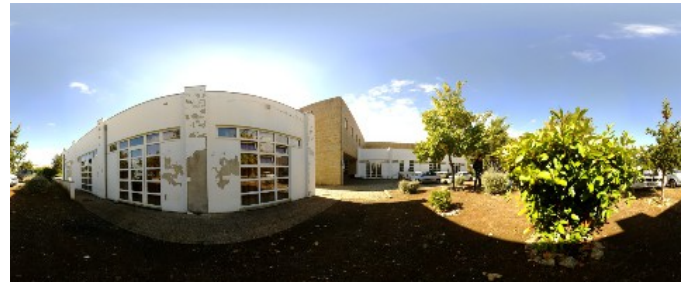
Figure 2- Example of image collected by scanner.