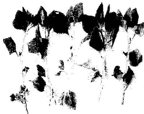
Figure 1 – New Zealand spinach ( Tetragonia tetragonioides )

Commercial sheaves of New Zealand spinach (figure 1) were bought in two regional supermarkets. From each sheaf, three sub-samples were prepared by separating the leaves (petiole + blade) from stems. Dry matter percentages of sub-samples were obtained by weighing the fresh and oven-dried (70 °C) material. Dried material was ground and sieved. Extracts were prepared by adding 50 ml of distilled water to 1 g of dry matter and shaking for an hour. The extracts were filtered in paper Watmann 40 (Ø 12.5 cm), and nitrate concentrations determined by UV/Vis. spectrophotometry.