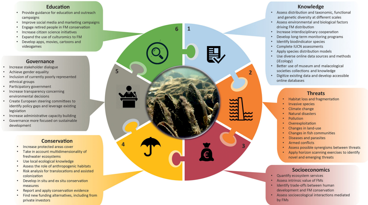
FIGURE 1 Roadmap to freshwater mussel (FM) conservation in Europe encompassing six interrelated, major conceptual areas that need short- and long-term attention. For each conceptual area, the most pressing priorities are listed.

destruction of bridges and dams, malfunctioning of wastewater treatment plants, oil spills, and pollution (e.g., heavy metals and nuclear materials) (Richardson, 1994).