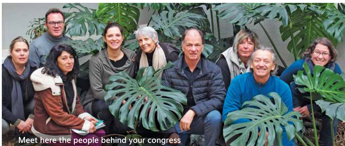
Meet here the people behind your congress