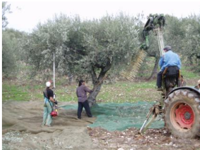
Figure 3: Oli-picker and a mechanical branch shaker working simultaneously.

Work method 2 – For a particular tree (sometimes a pair of trees), the Oli-picker is positioned in a single station. It will only be moved from that station after the tree had been totally harvested. To assist in the detachment of fruits out of reach three labourers shake the canopy with long wood poles while a fourth labourer operates a mechanical branch shaker (Figure 3).