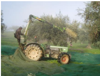
Figure 1: Oli-picker spiked coomb.

The “Oli-picker” harvester is commercially available, and operates brushing the tree canopy with a spiked cylindrical coomb (Figure 1) mounted on a hydraulic articulated arm, making possible operation, inside or around the olive tree crown.