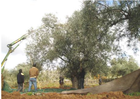
Figure 2: Oli-picker can detach olives efficiently in large trees.

The Oli-picker is mounted in the back of a 59 kW agricultural tractor, which provides pto power for the hydraulic power pack of the equipment. A spiked cylindrical coomb which can turn round its axle provides the brushing action to detach olives. The coomb is mounted at the end of an articulated arm, allowing freedom to brush the canopy around or inside the tree crown (Figures 2 and 3).